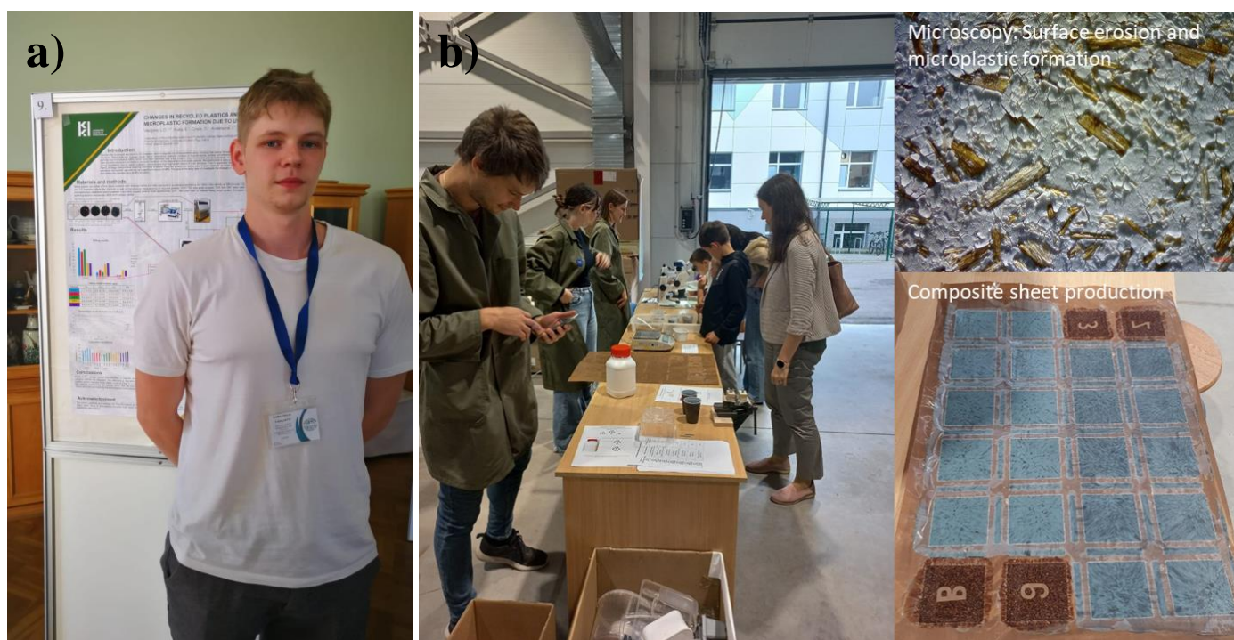
Figure 1. Publicity of the project results a) a poster at the international conference Baltic Polymer Symposium 2023 and b) participating in the event "Researchers' Night 2023."